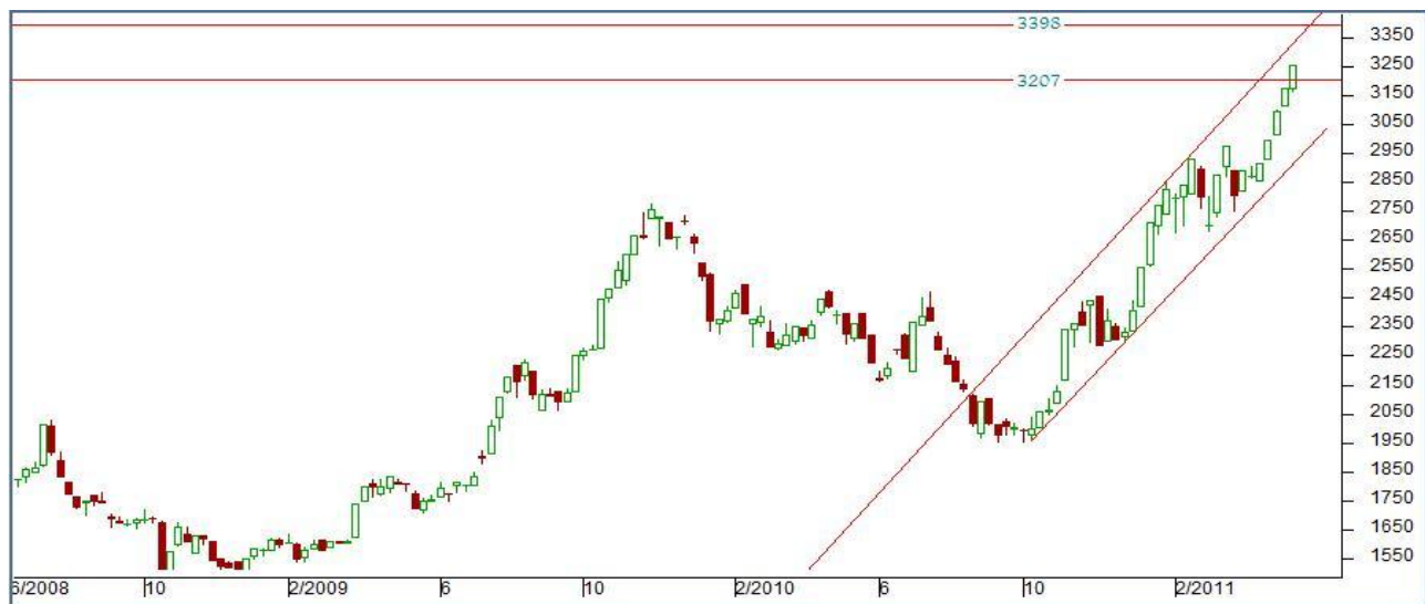
Fig-2 – Guar Seed Spot Prices (Jodhpur) Technical Analysis.

As evident from the above weekly chart, guar seed prices are moving in the rising channel and overall the trend remains up and intact. Immediate good support is at 3207 level and resistance at 3398 level. Guar seed prices for the coming week is expected to remain in the range of 3207-3398 and one should opt for buying guar seed at 3207 for the target of 3398.