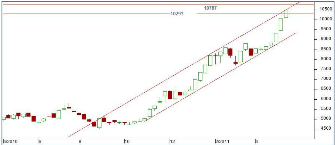
Fig-3 – Guar gum Spot Prices (Jodhpur) Technical Analysis.

As seen in the above weekly chart, guar gum prices are moving up. Immediate good support is at 10293 level and resistance at 10787 level. Guar gum prices for the coming weekly is expected to remain in the range of 10293 – 10787 and market participants should go for buying at 10293 in cash market.