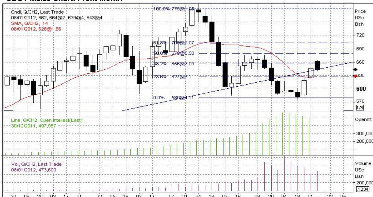
CBOT Maize Chart: Front Month