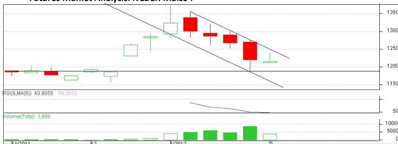
(March Contract Weekly Chart)