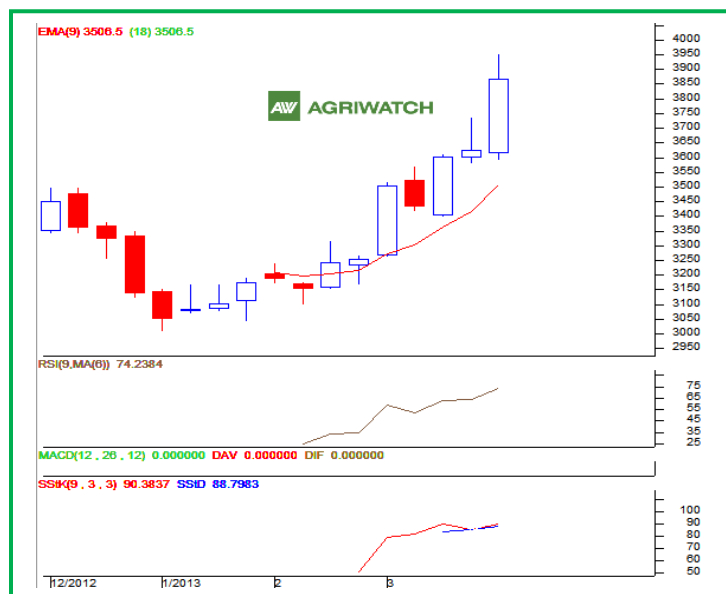
NCDEX Soybean Futures-Weekly Chart