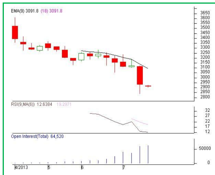
NCDEX Soybean Futures-Weekly Chart