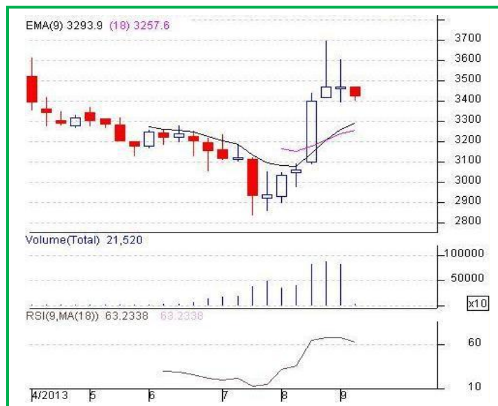
NCDEX Soybean Futures-Weekly Chart