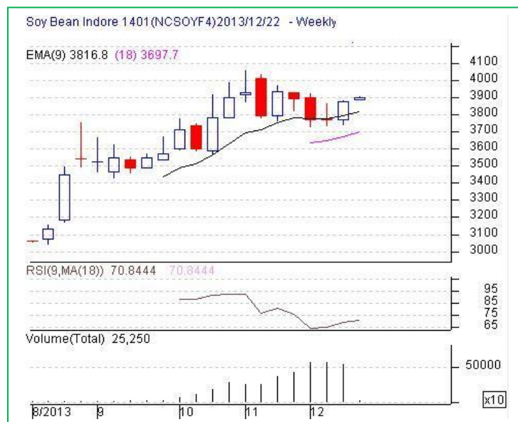
NCDEX Soybean Futures-Weekly Chart