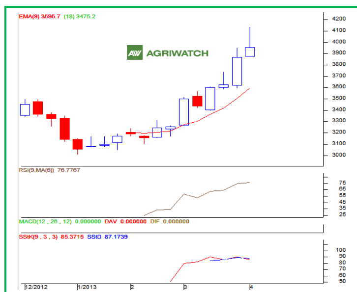
NCDEX Soybean Futures-Weekly Chart