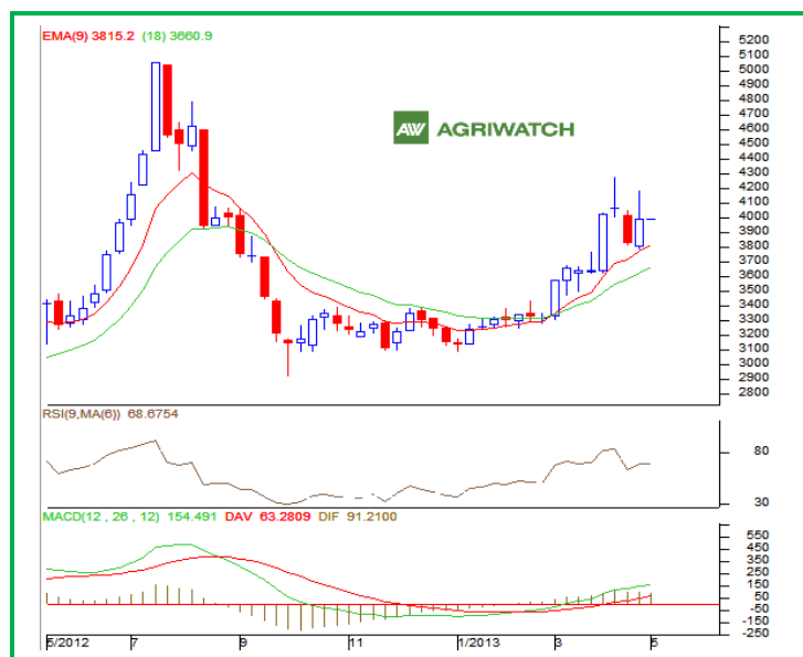
NCDEX Soybean Futures-Weekly Chart