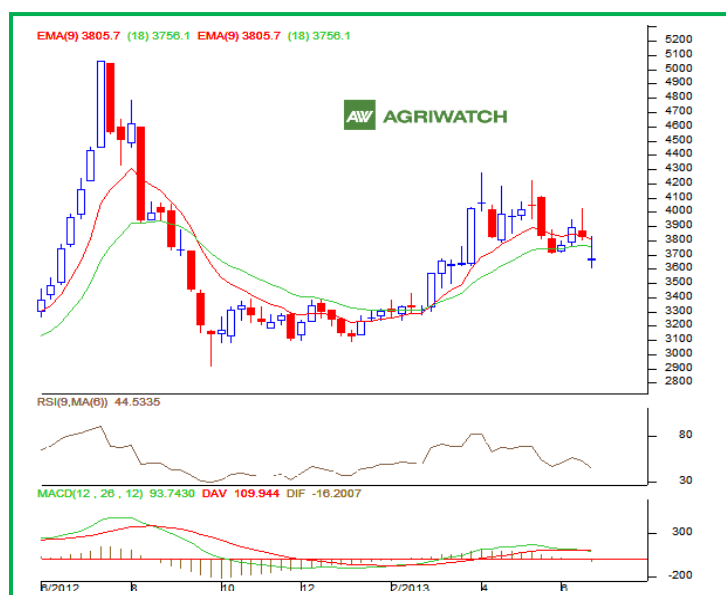
NCDEX Soybean Futures-Weekly Chart