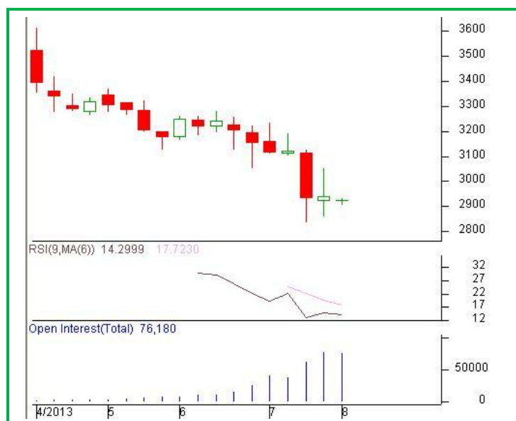
NCDEX Soybean Futures-Weekly Chart