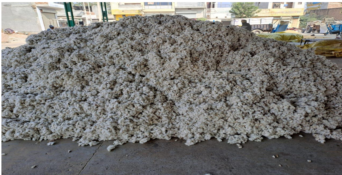
Cotton arrivals at Bhatinda Market (29.11.22)

As per AgriWatch sources, Arrivals are lower as farmers are holding cotton in anticipation of higher prices in the near term. Also, there are reports of shorter staple length than the prescribed of 27 mm.