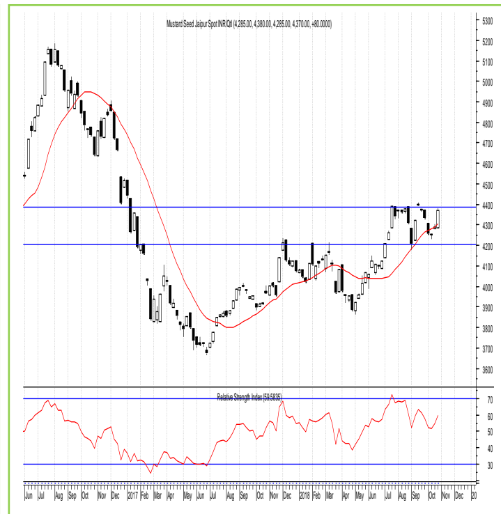
RM Seed Spot, J