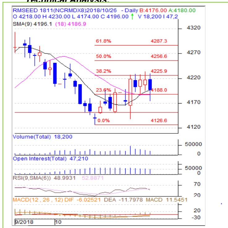
NCDEX RM Seed Futures