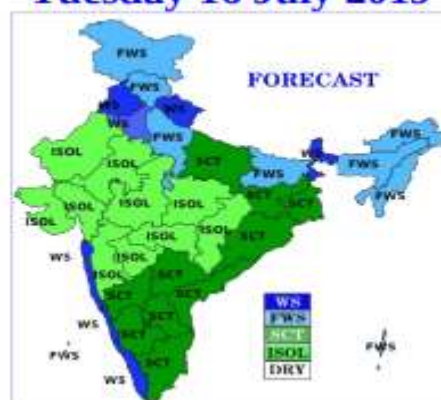
Tuesday 16 July 2019