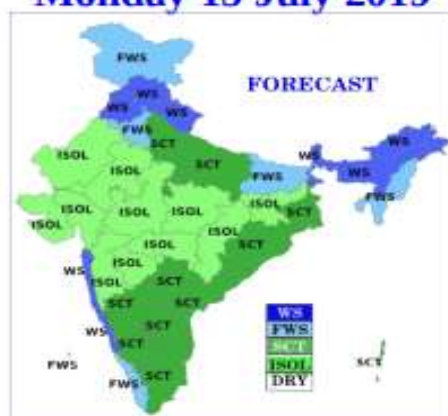
Monday 15 July 2019