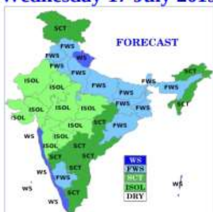
Wednesday 17 July 2019