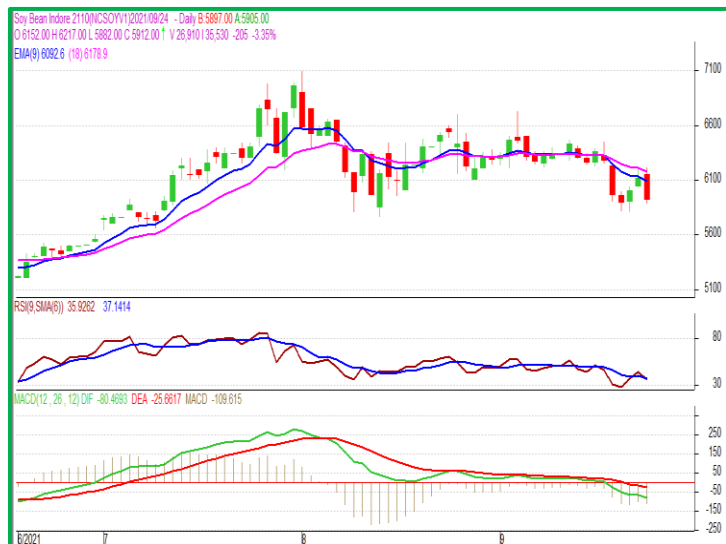
NCDEX Soybean Futures – October Contract