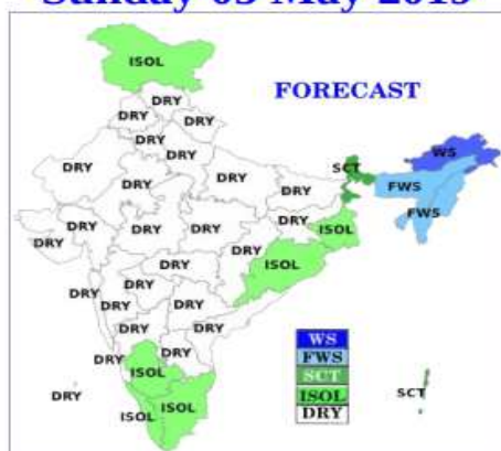
Sunday 05 May 2019