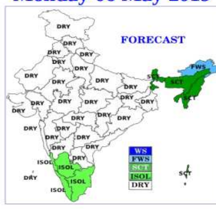
Monday 06 May 2019