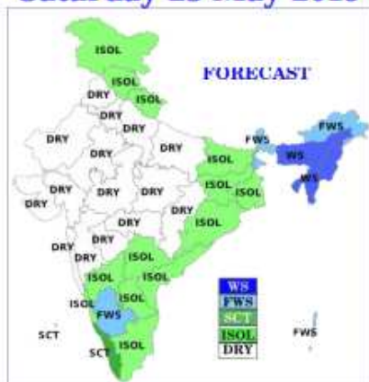
Saturday 25 May 2019