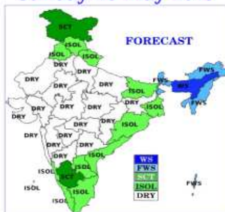
Sunday 26 May 2019