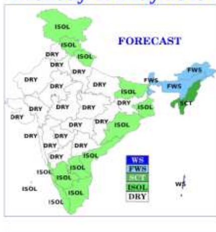
Monday 27 May 2019