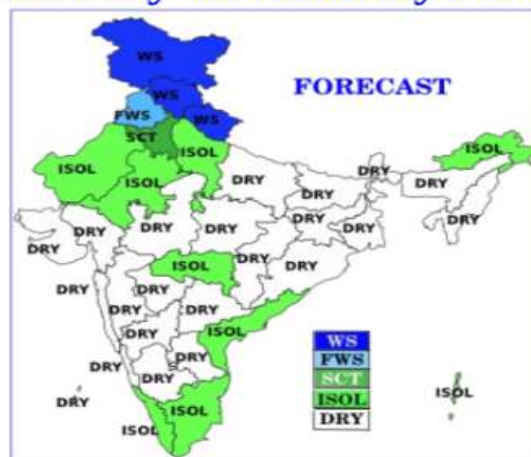
Monday 06 January 2020