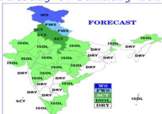
Tuesday 07 January 2020