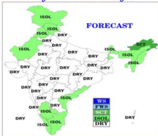
Sunday 05 January 2020