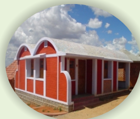
Low Cost Housing